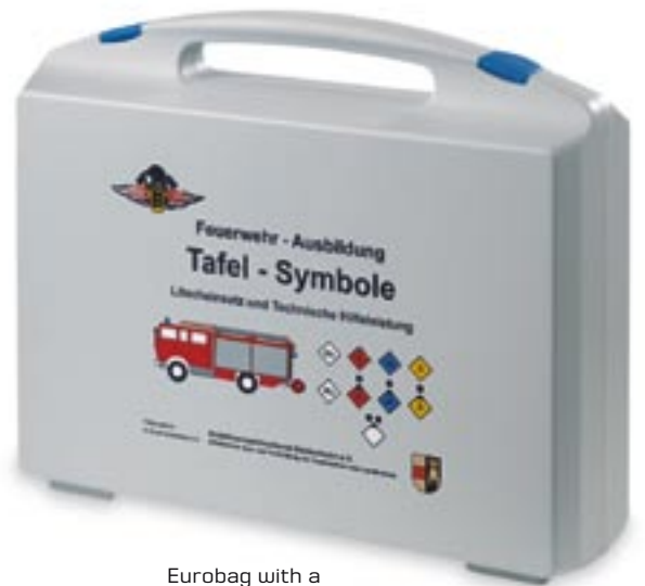
Eurobag with a multi-coloured, durable, long-lasting screen print.

○ not possible *to special order For technical reasons sizes may sometimes vary from those as printed.