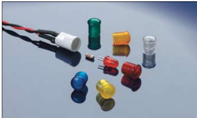
U.S. & Foreign Patents Issued and Pending